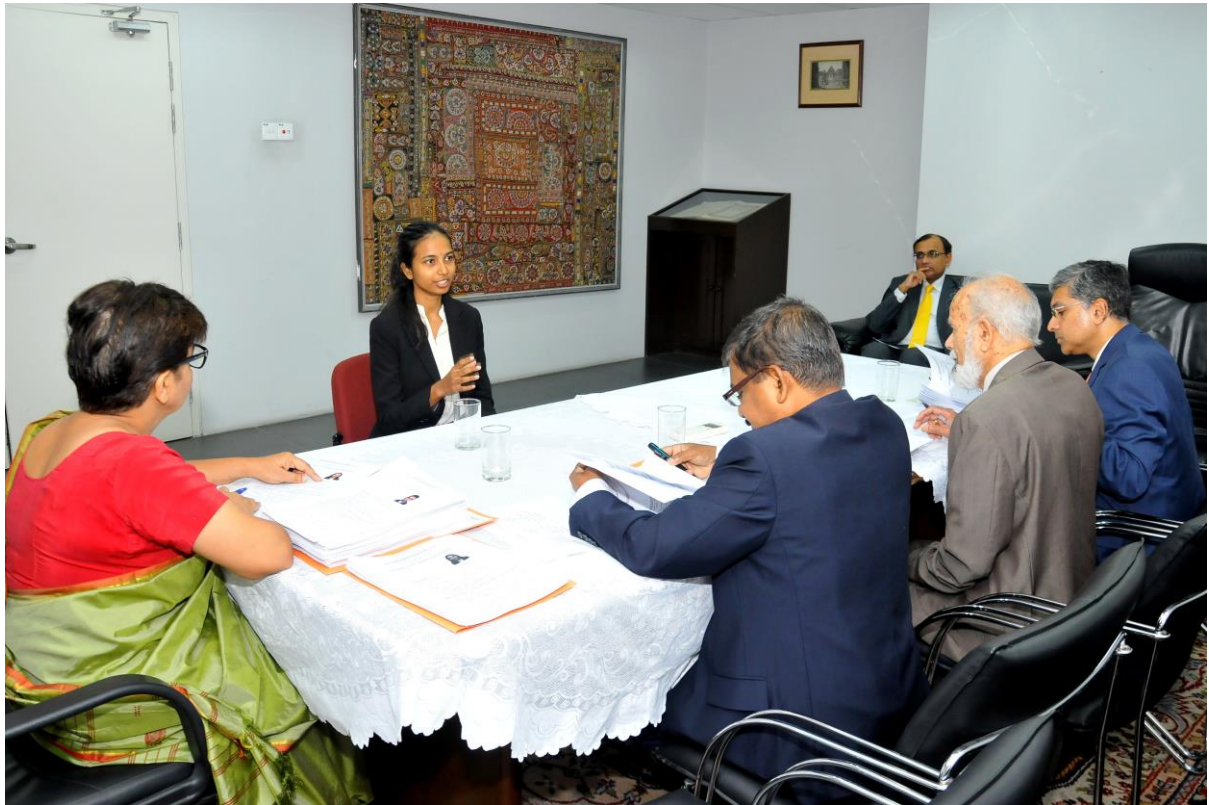
ISTF scholarship interview with a candidate is in progress on 06.09.2017